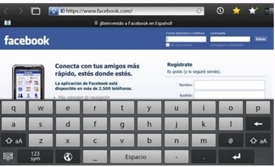
Como instalar android en blackberry playbook. Se puede instalar android en blackberry playbook. Blackberry playbook setup. Como instalar android en tablet blackberry playbook. Instalar android en tablet blackberry playbook. Can you install android on a blackberry playbook.