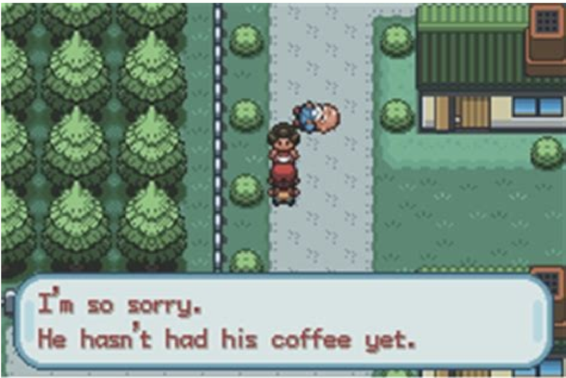
Pokemon red fire gba cheats. Best pokemon rom gba. Pokemon omega fire red rom gba download.