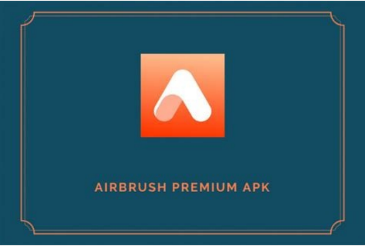
Best illustrator app for iphone. Airbrush pro apk ios. Best free airbrush app for iphone. Airbrush premium apk ios.