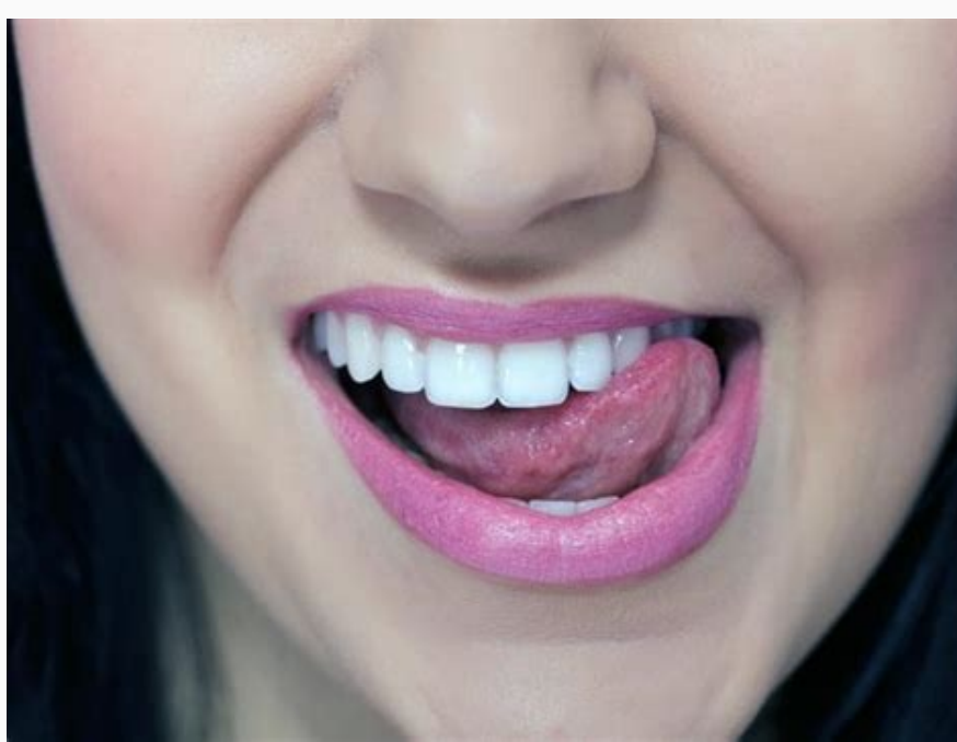
How take care of a tongue piercing.