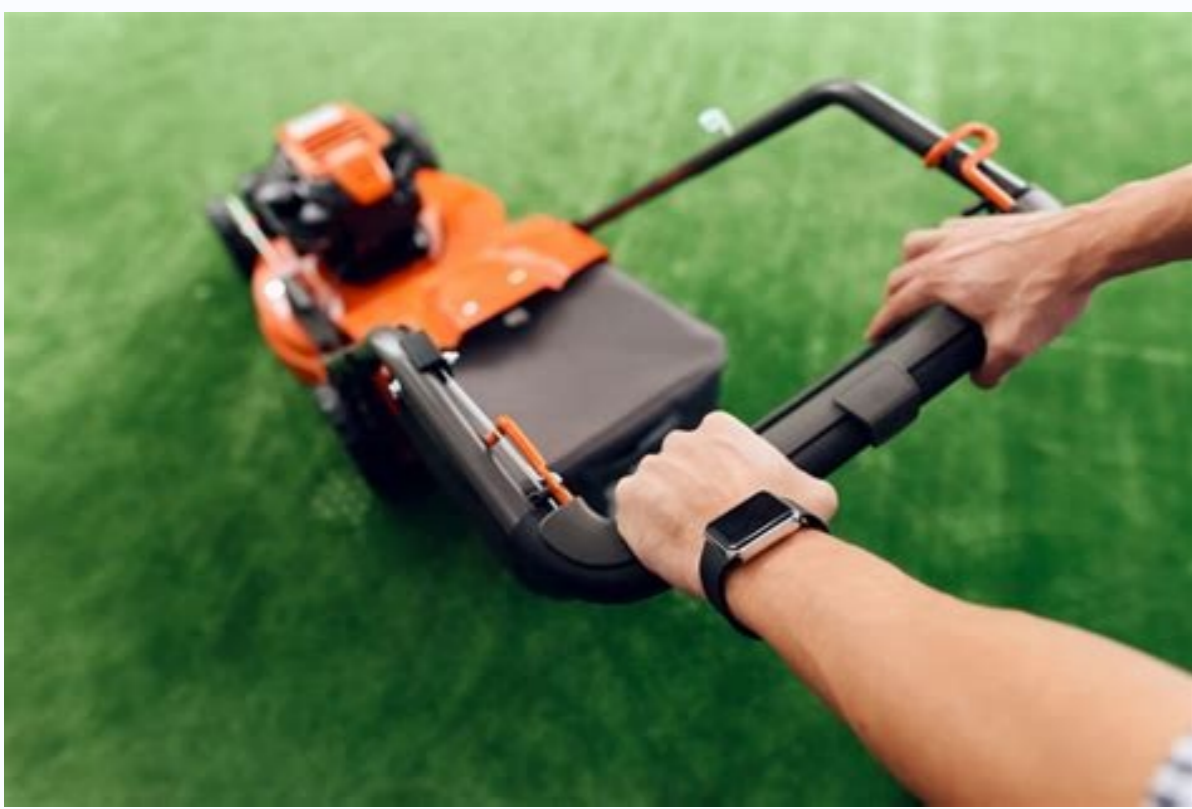
Podadora manual truper