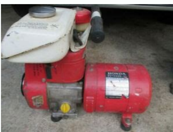
Honda generator 3000 wont start. Honda 3000 generator shop manual. Honda ex 3000 generator manual. Honda 3000 generator repair manual. Honda 3000 generator parts manual. Honda em3000 generator manual. Honda eg 3000 generator manual.